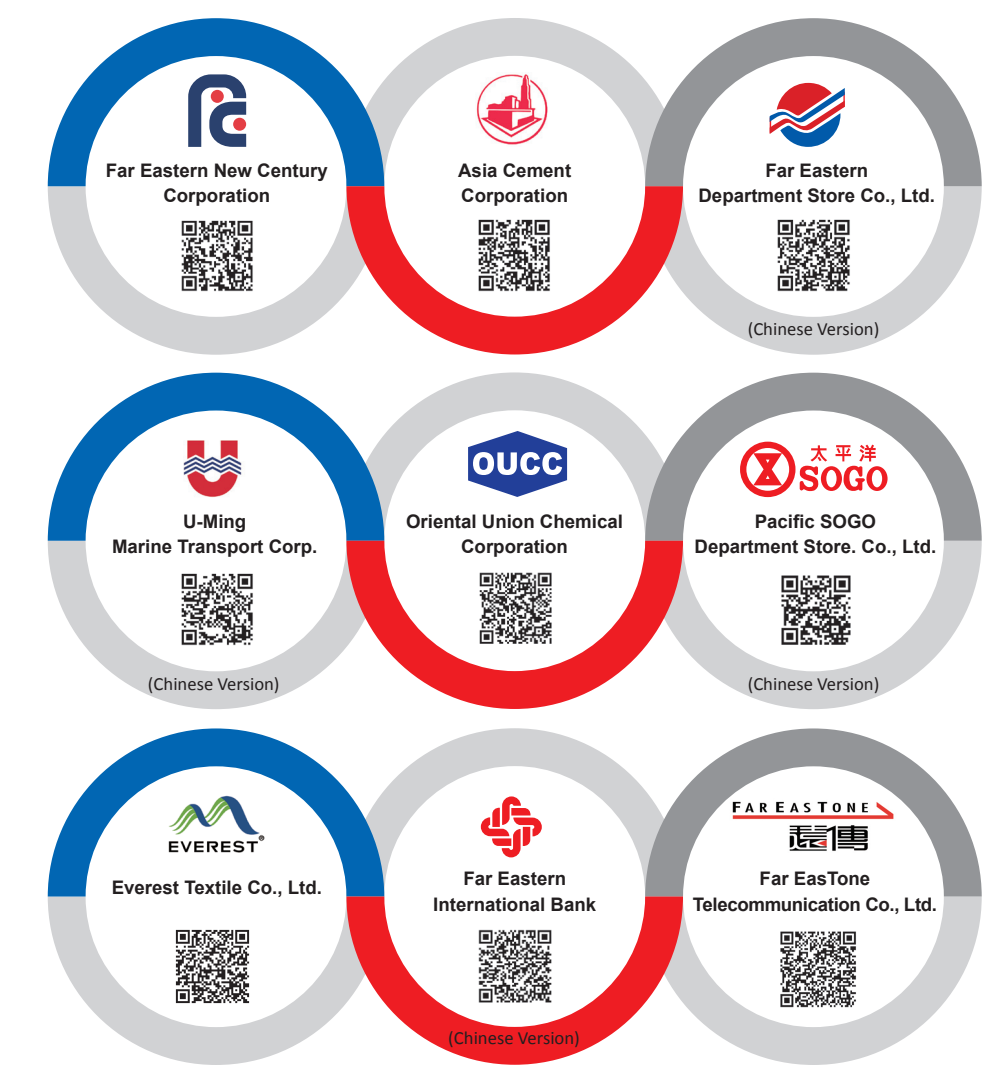
CSR Websites of the Companies under Far Eastern Group

Note : • The companies are listed in a chronological order of their establishment.